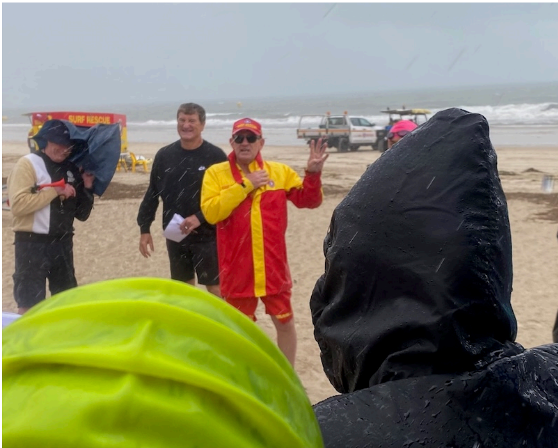
CAN YOU HEAR ME...??