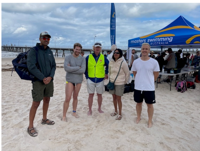
Ready and waiting...