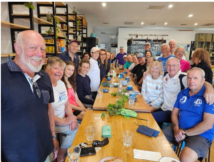
Post swim conviviality, Coastal Delicatessen